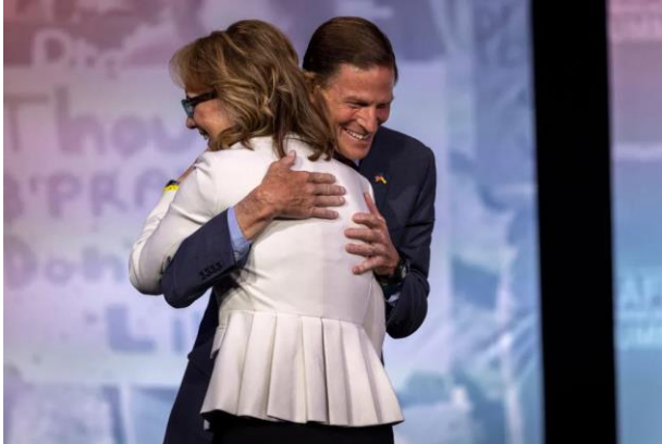
Sen. Richard Blumenthal hugs gun control advocate and former Rep. Gabby Giffords after her address during the National Safer Communities Summit at the University of Hartford on Friday.

President says he's 'optimistic' about continued efforts to control guns