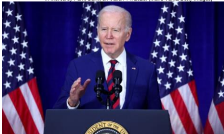
President Joe Biden delivers remarks at the Boys and Girls Club of West San Gabriel Valley in Monterey Park, Calif., on March 14, 2023.