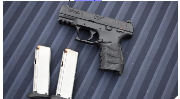
Gun rights groups say the new law is a boost to Second Amendment protections.

Republican Gov. Kevin Stitt on Tuesday signed a bill that would bar cities and counties in Oklahoma from enacting so-called "red flag" gun seizure schemes.